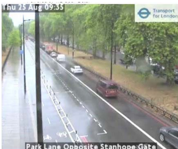
Photo above is of Park Lane opposite Stanhope Gate in the August Bank Holiday week from a TfL camera showing a queue of slow-moving traffic in mid-