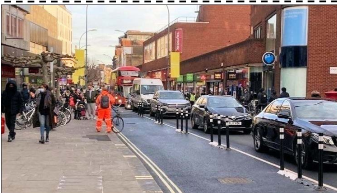
King Street/ Chiswick High Road Cycle Lane Scheme.

See photograph left of the congestion this has caused.