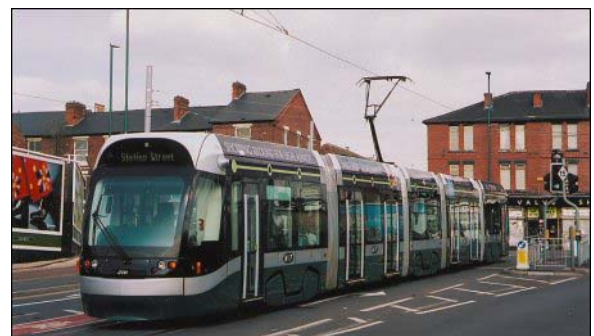
A Nottingham Tram